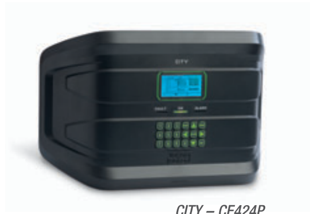
CITY – CE424P